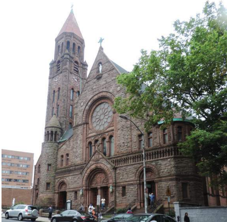
Yonkers Oldest Catholic Church