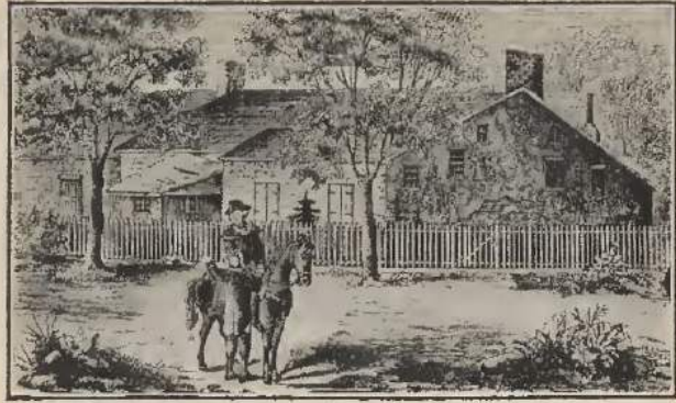
famous drawing of Gen. George Washington in Yonkers at Valentine