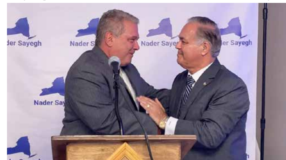
Mayor Mike Spano, left, endorsing Assemblyman Nader Sayegh

Yonkers Mayor Mike Spano recently endorsed Nader Sayegh for re-election to the State Assembly. In remarks delivered at a Sayegh Campaign Rally Tuesday, September 20, the Mayor praised Sayegh for bringing home millions of dollars in State aid that is driving economic development and improving public education.