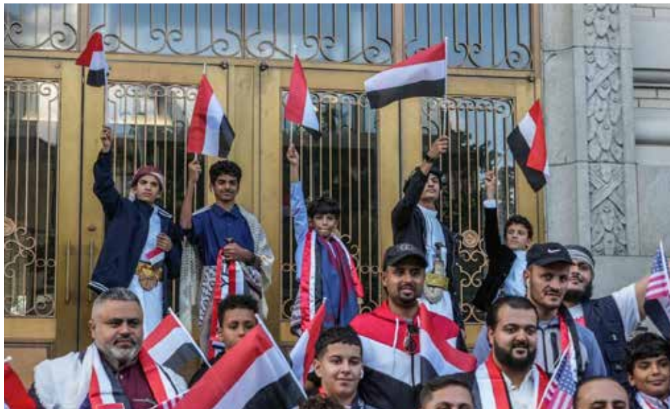
Yonkers is one of America's most diverse cities and we will continue to embrace our different cultures.