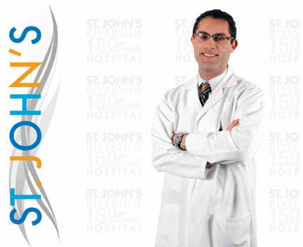
"Lifestyle changes can improve your blood pressure more than cholesterol, but they work for both," Dr. Alon Gitig, pictured above