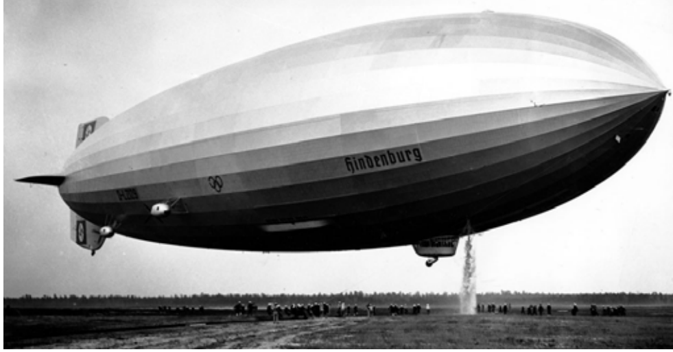
The Hindenberg flew over Yonkers in 1936 before exploding in New Jersey