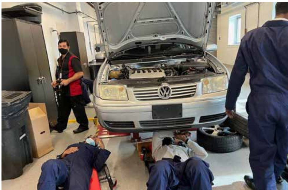
CSEE's Auto Shop, above, and rendering of new auditorim under construction, below