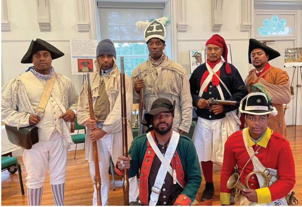
The heavy rains last weekend washed out a lot of events, including Yonekrs Riverfest. But at Philipse Manor Hall, the Harvest Festival carried on. Pictured above are Revolutionary War re-enactors.