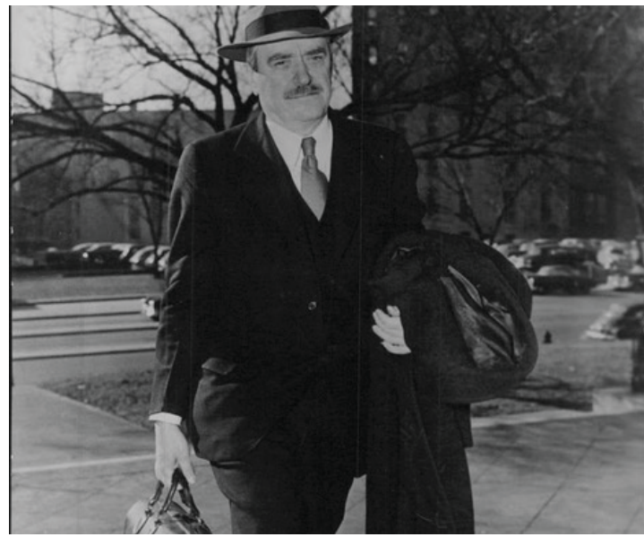
Earl Browder Communist Party Candidate for President Twice, from Yonkers