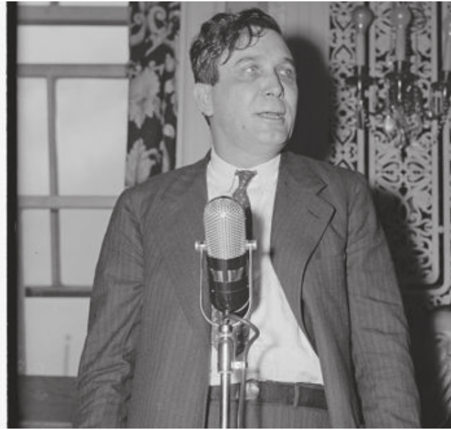
Republican Presidential candidate Wendell Wilkie campaigned in Yonkers in 1940