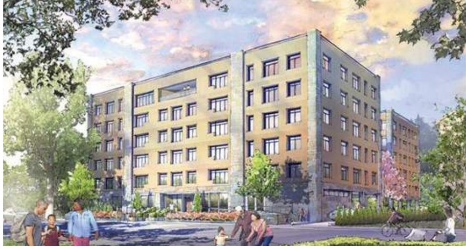
Hudson Hill, one of two new affordable housing developments in Yonkers

CPCY is happy to share the following information about two new affordable housing developments in Yonkers that are accepting applications now and will soon be open!