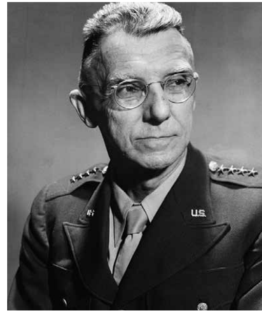
General Joseph W. Stilwell, "Vinegar Joe" from Yonkers