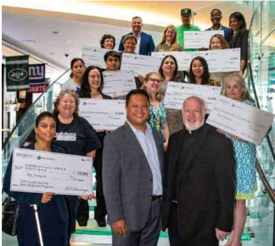
Eight area nonprofits benefit from MGM Resorts employee and guest-driven Community Grants Program

Empire City Casino by MGM Resorts (“Empire City”) donated $102,000 to eight local nonprofit organizations through multiple grant funding opportunities. Grants were distributed to organizations providing services in the core MGM Resorts philanthropy areas. These areas include food insecurity programs that provide access to nutritious meals, educational programs that support academic success, workforce development initiatives providing educational and training programs to prepare individuals for sustainable career opportunities and a new initiative this year, the homelessness initiative, to support organizations making an impact in combating homelessness in our surrounding communities.