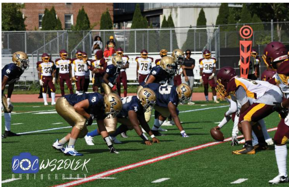
Yonkers Force played their first game of the season at Roosevelt HS