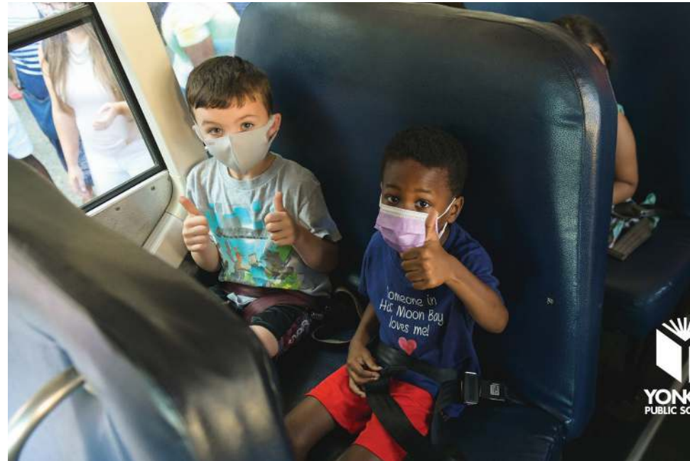
Yonkers students take the bus for the first time