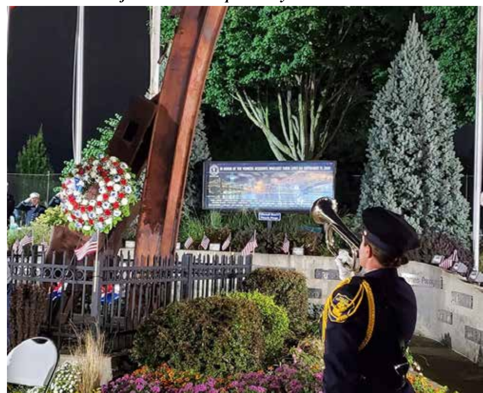
Above: A YPD officer plays taps at the McLean Avenue memorial