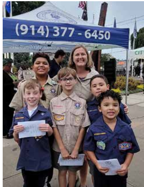
Above: Young Boy Scouts and Cub Scouts in attendance