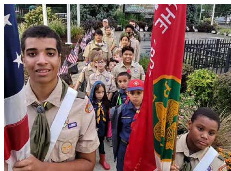
Below: Young Boy Scouts and Cub Scouts were part of all the ceremonies

The City of Yonkers held ceremonies on September 11, 2022 commemorating the 21 anniversary of the Sept. 11 attacks in 2001 that killed 26 Yonkers residents on that day, and the 9 first responders and construction workers who died in the years after.