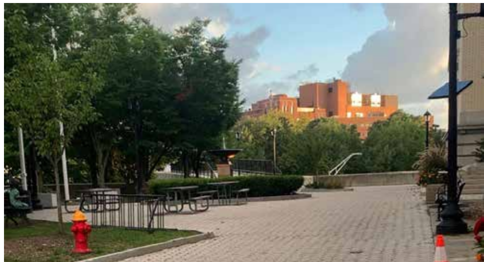
The Unity Fountain outside of City Hall was empty on September 13 for a rally