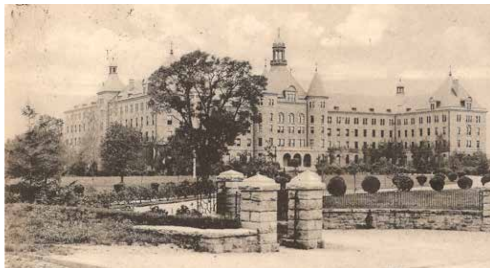
St. Joseph’s Seminary welcomed its first class in 1896