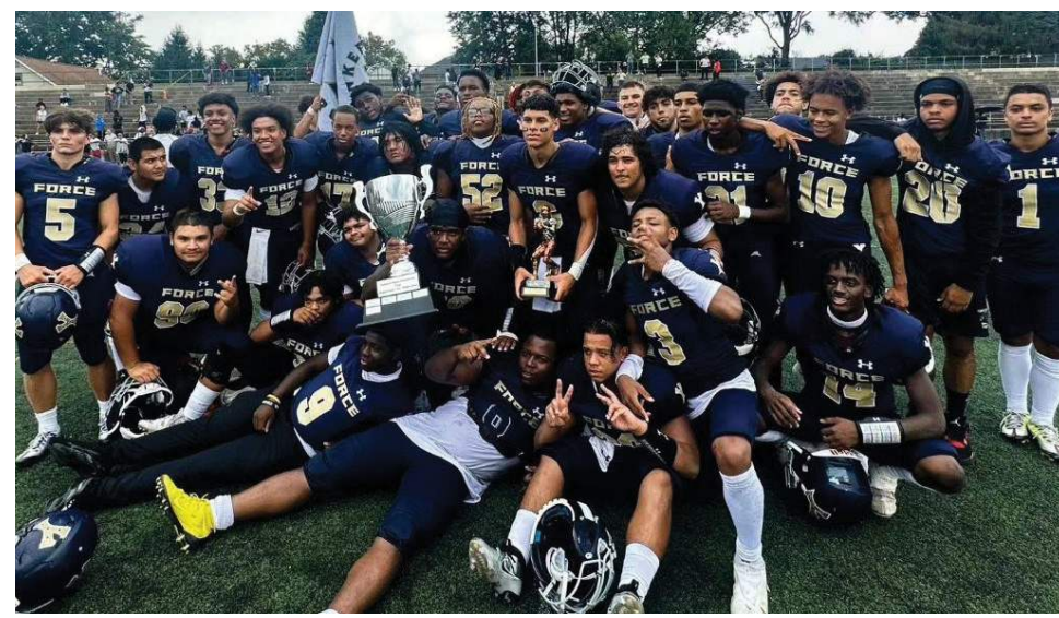
above: members of the Yonkers Force football team celebrate with the Superintendent's Cup after a high scoring 35-26 win.