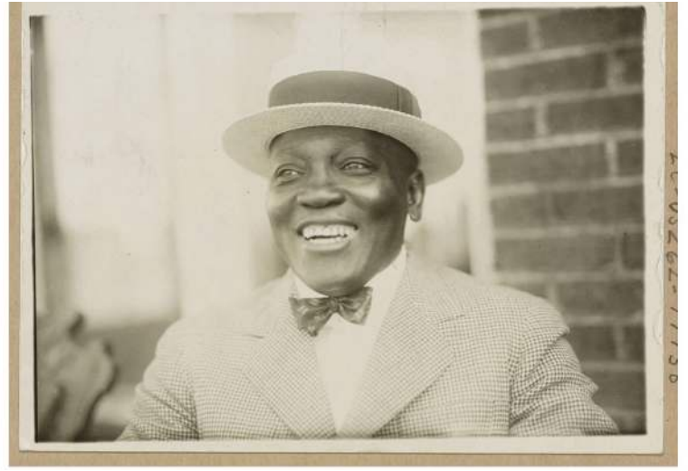
Heavyweight Boxing Champ Jack Johnson came to Yonkers in 1933 to look at locations for a night club