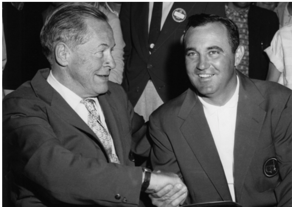
golfer Doug Ford, right, with Bobby Jones after winning the Masters, may be the greatest golfer from Yonkers