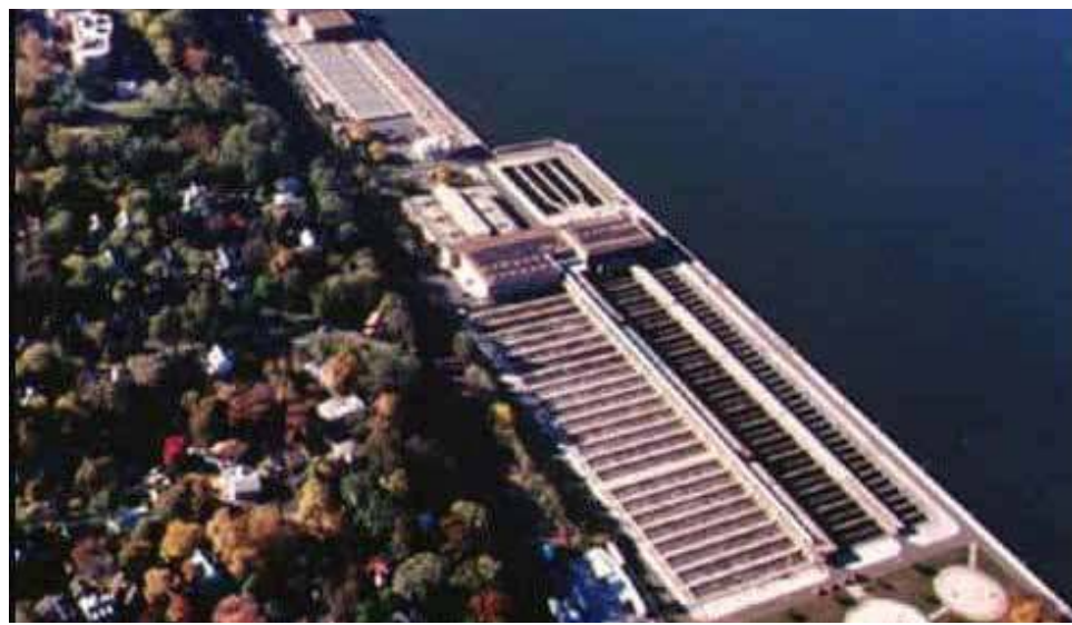
The Wastewater Treatment Plant in Yonkers, operated by Westchester County