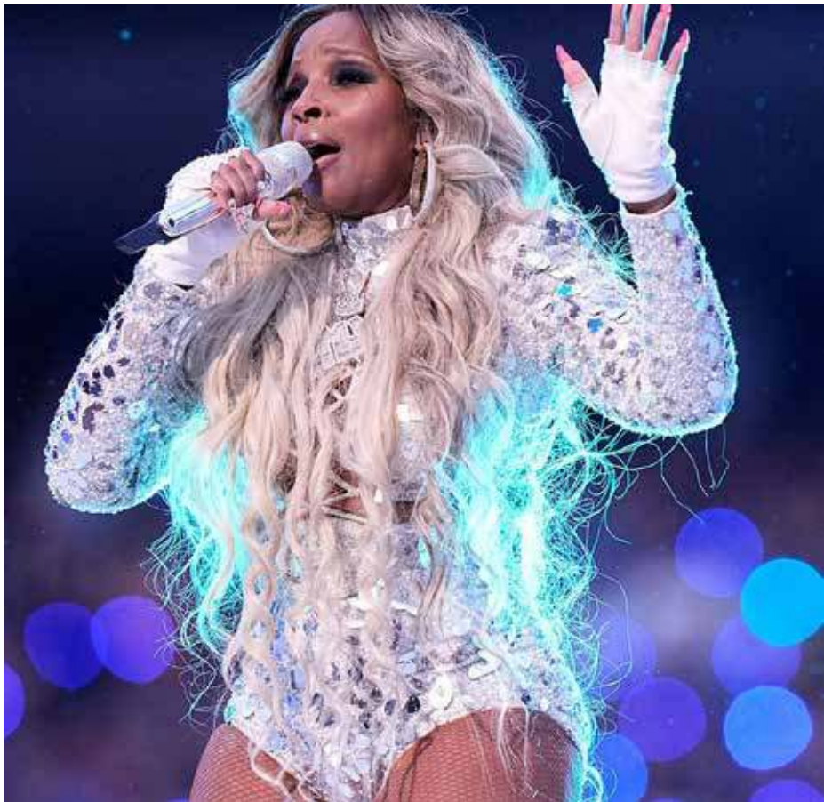
Mary J. Blige, performs at Super Bowl 56