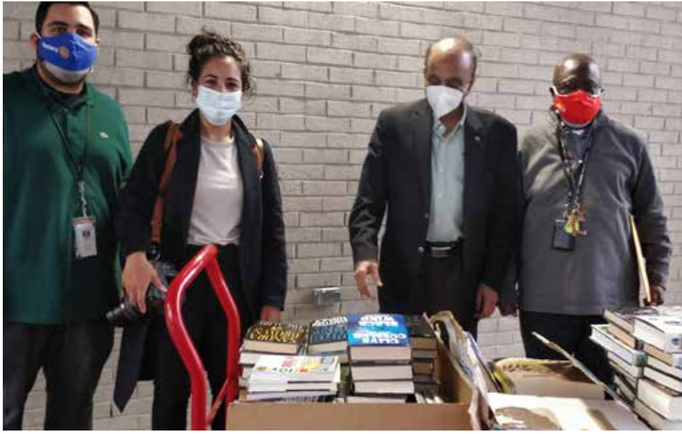
Yonkers Rotary members handed over 250 hardcover books to the Riverfront Library