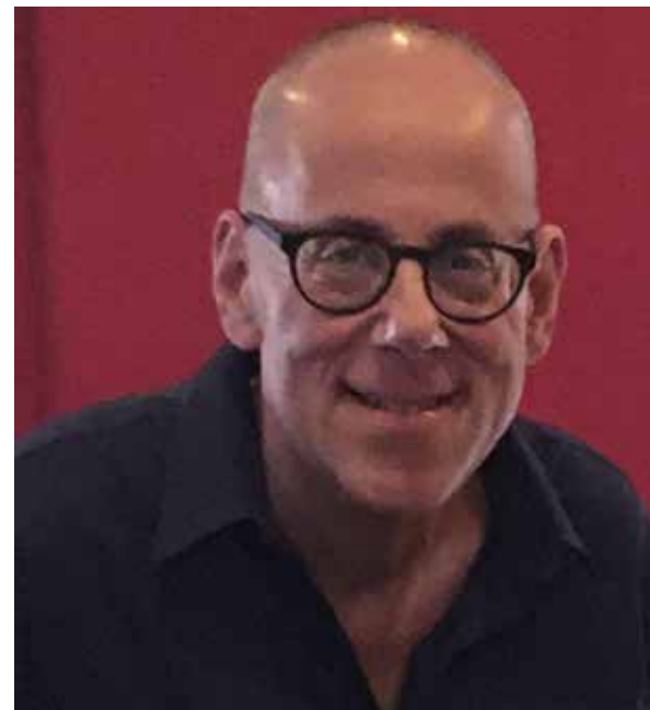
By Eric W. Schoen

Remember the good old days at the United States Postal Service, USPS. Mail men and woman would deliver the mail neatly dressed in their uniforms. You knew their name. You knew approximately what time they would arrive. The only deviation would be on the one day your mail person had off. If you went on vacation the mail person would bring your mail to your home or apartment the day you returned.