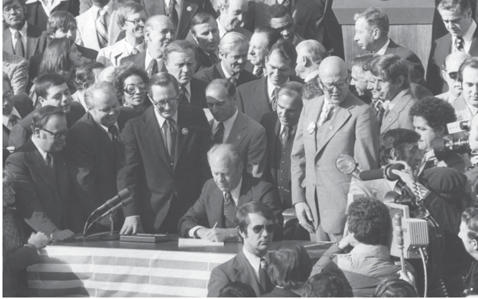
President Gerald Ford, at Yonkers City Hall, 1976