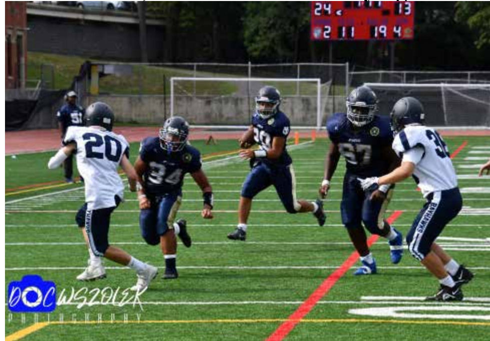
The Yonkers Force, in their victory over St. Dominick's, is off to a good start