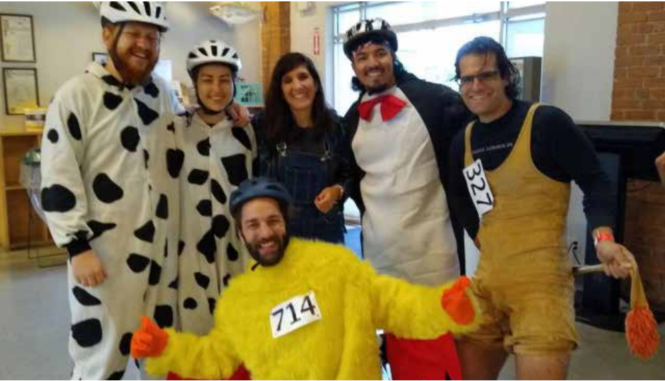
below: Bikers Take Off