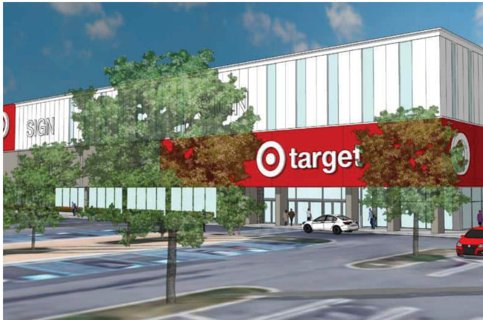
rendering of Target Yonkers Cross County