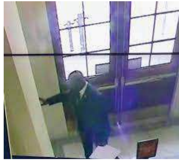
Congressman Jamaal Bowman caught on video pulling a fire alarm in the US Capitol Building