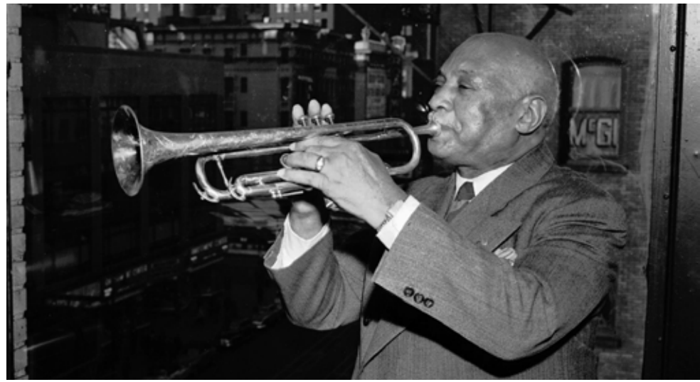
W.C. Handy, The Father of the Blues