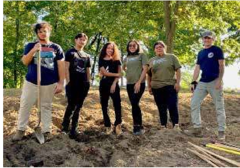
YPIE Student Summer Interns plant new garden at the entrance of Untermyer Gardens

In 2019, Untermyer Gardens formed a partnership with Yonkers Partners in Education (YPIE) to offer summer internships for students across all Yonkers high schools to assist in beautifying the gardens. These internships have made a life-changing impact on students, deepening their love for nature and desire to give back to their community.