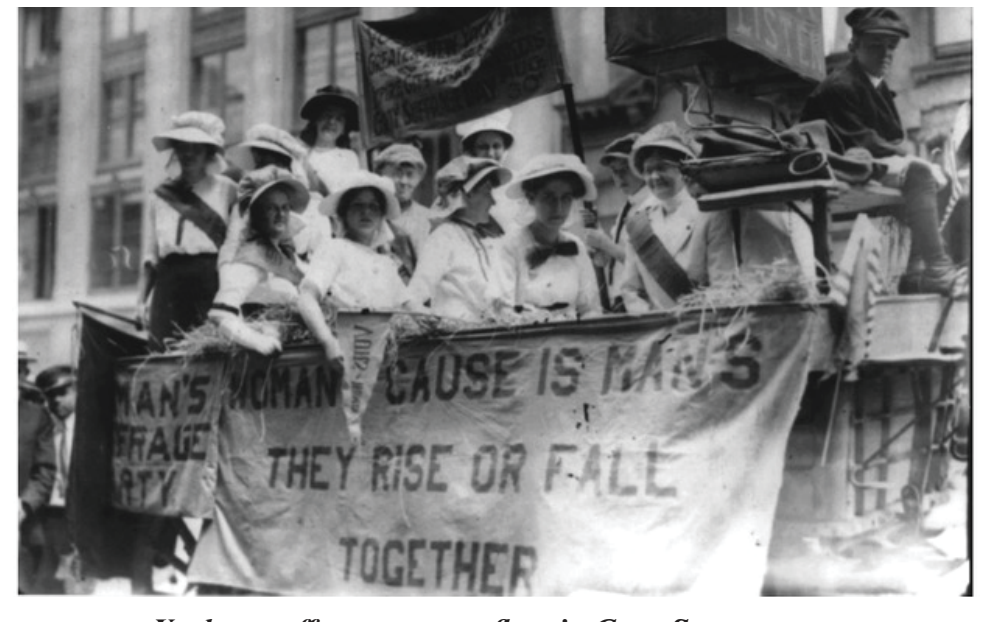
Yonkers suffragettes on a float in Getty Square