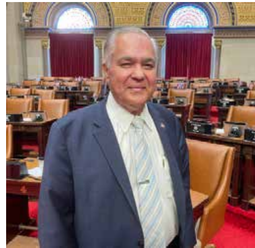
Assemblyman Nader Sayegh