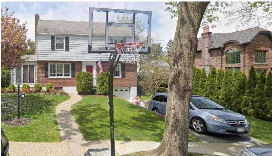
of 142 Chittenden Avenue