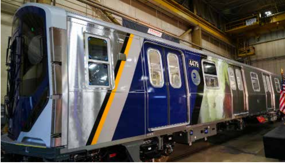
One of the 5,000 completed Kawasaki rail cars built in Yonkers

Kawasaki in Yonkers, continued from pg 1-