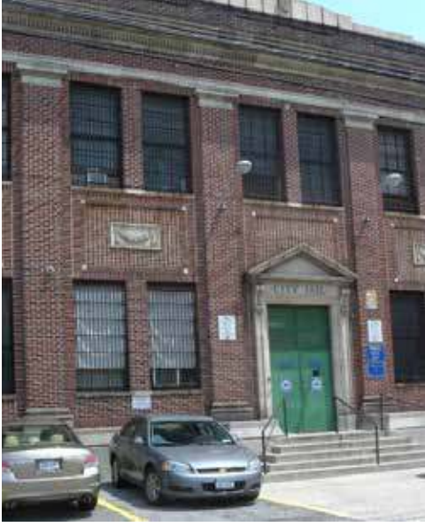
the old Yonkers City Jail on Alexander Street