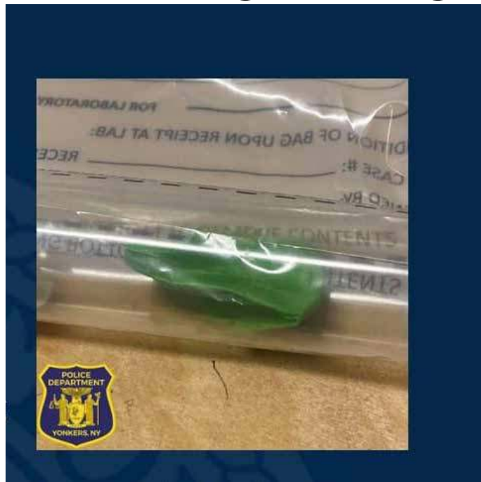
three recent overdoses in Yonkers were believed to have come as a result green packages of heroin laced with Fentanyl, left.

Drug overdose fatalities surged during the COVID-19 pandemic in New York state, with opioid-related overdose deaths increasing by 68% to nearly 5,000 individuals from 2019 to 2021, according to an analysis released today by New York State Comptroller Thomas P. DiNapoli. The surge is largely due to a sharp increase in deaths from opioids related to illicit fentanyl and similar synthetic opioids. Overdose deaths statewide from opioids and all drugs (5,841) in 2021 surpassed the previous 2017 peak by more than 1,700 fatalities.