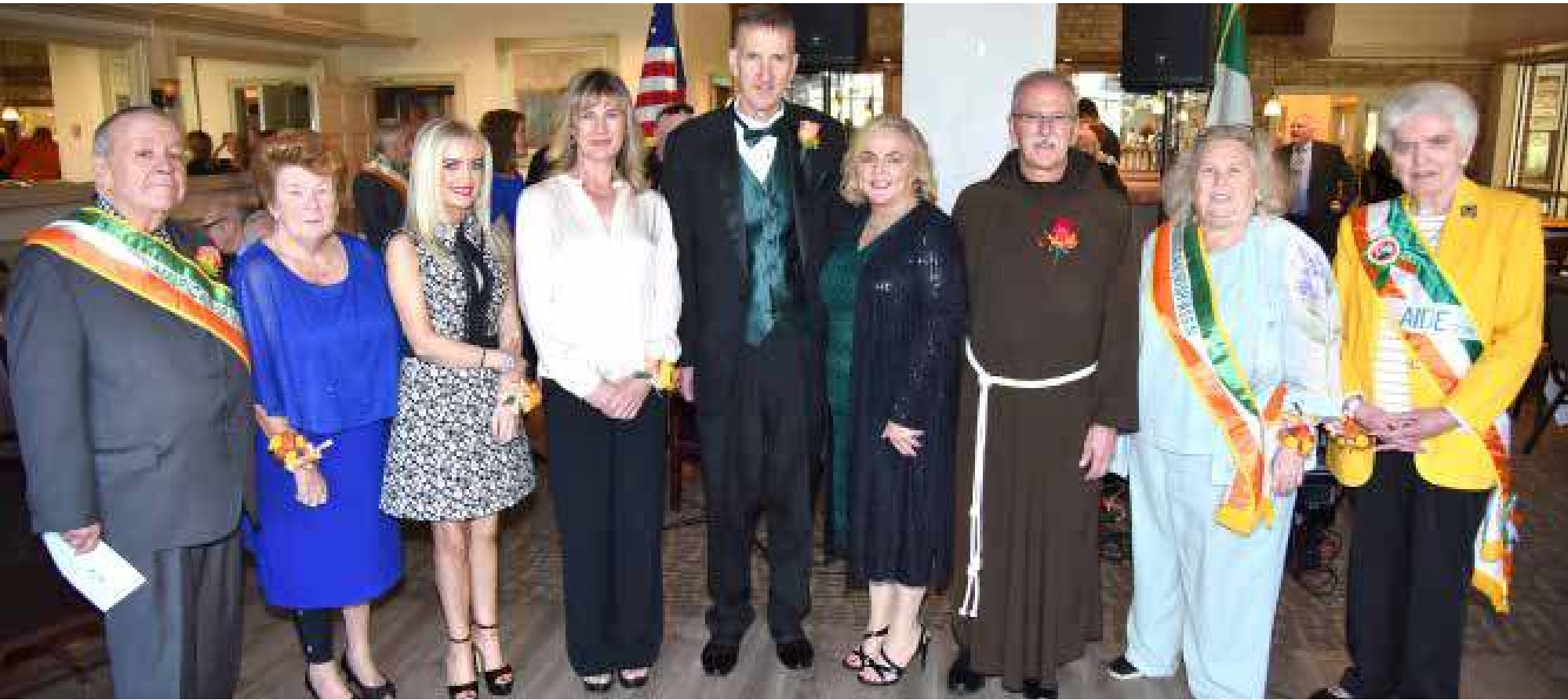
AIAW Honorees with Committee Members