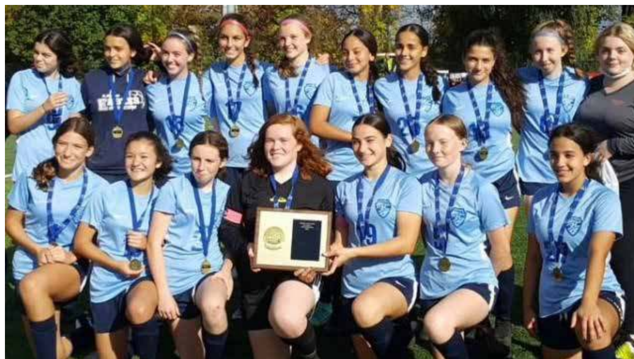
Members of the YMA Girls Soccer Team