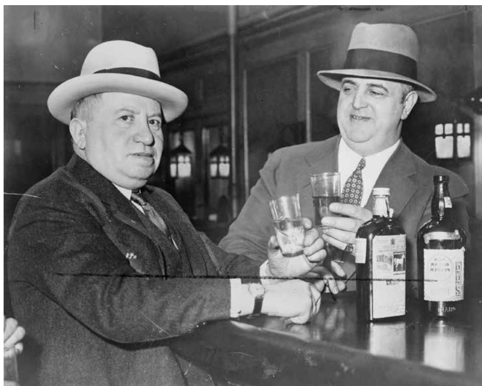
Federal prohibition agents, Izzy Einstein and Mo Smith