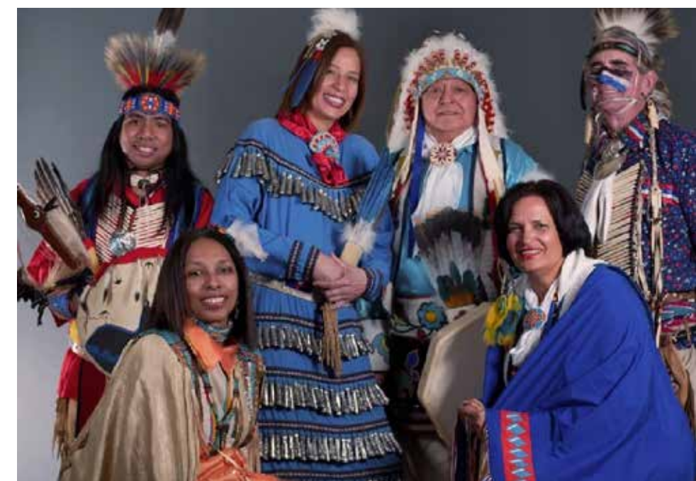
Above, Thunderbird American Indian dancers; below Glenview Mansion holiday tour.