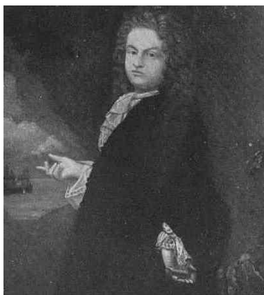
Frederick Philipse, the First Lord of Yonkers and the richest man in Westchester