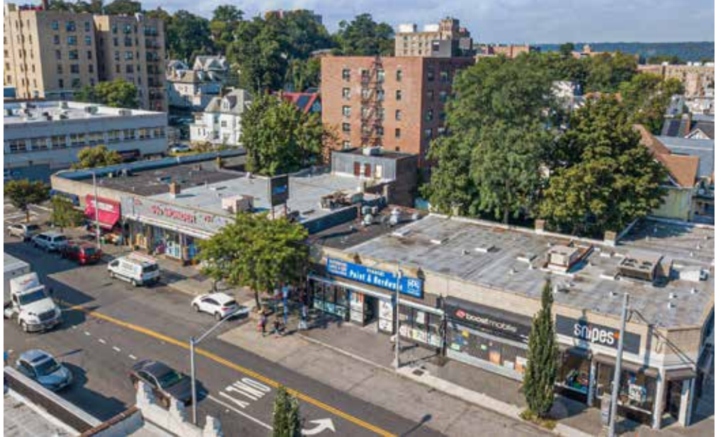
465-479 South Broadway, Yonkers

Houlihan Lawrence Commercial, a division of Houlihan Lawrence, the leading real estate firm serving New York City's northern suburbs, has announced the sale of 465-479 South Broadway, Yonkers, NY for $4.7 million.