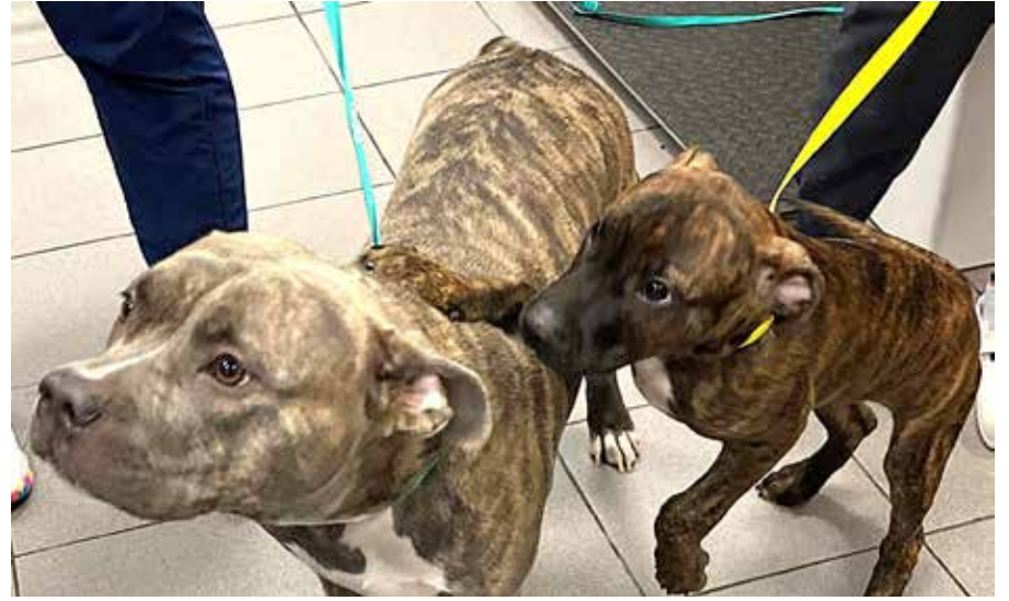
Pretty Girl and Champ