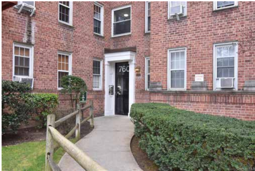
co-op at 760 Bronx River Road

On Saturday, November 16th, 2024, at approximately 1:30 PM, members of the Yonkers Police Department responded to an apartment inside 760 Bronx River Road on a report of a stabbing at the location. Upon arrival, officers located a male with a stab wound to his chest at the entrance to an apartment inside the location. The male related that he had been stabbed in the chest and that he had stabbed his brother-in-law. Officers then entered the apartment and located a second male lying unresponsive in bed with a stab wound to the chest. Officers began rendering medical aid and rushed both men to a local area hospital.