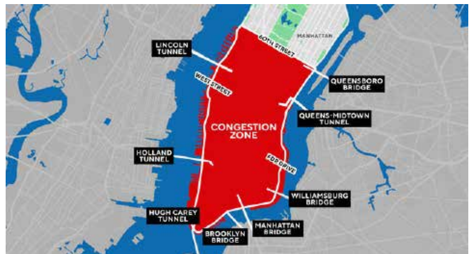
Plan Rushed Through Before Trump Takes Office