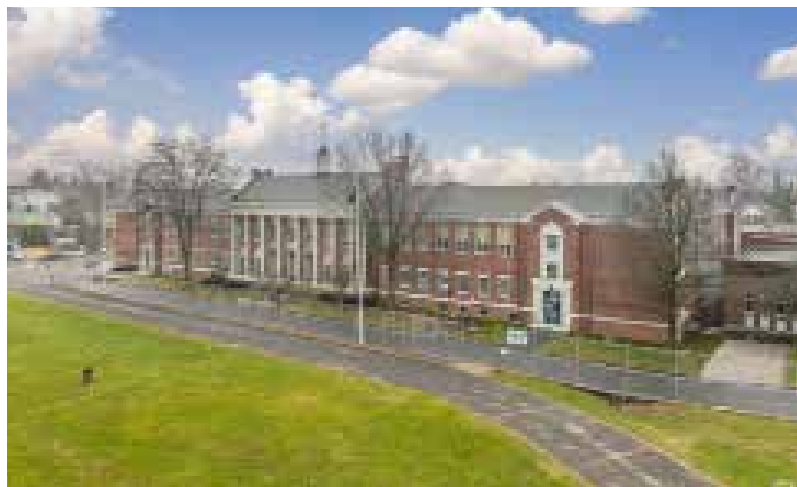
Gorton High School

On Nov. 14, just after 9:30 am this morning, members of the Yonkers Police Department responded to Gorton High School, located at 100 Shonnard Place in this City, on a report of a stabbing that had taken place.