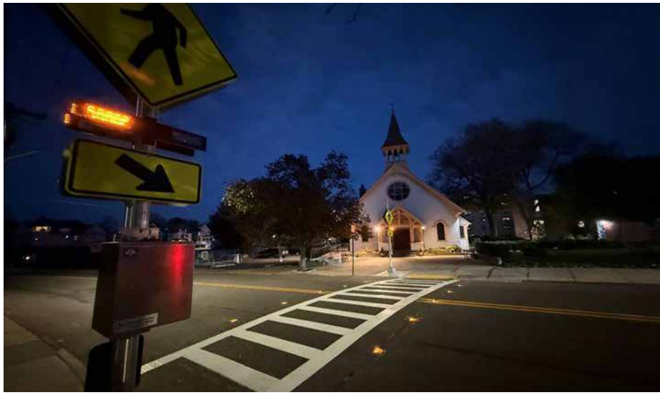
In-Road Warning System (IRWL) Crosswalk at North Broadway in Yonkers

On Nov. 12, Yonkers Mayor Mike Spano announced the installation of six new in-road solar LED crosswalks across the City. The new LaneLight In-Road Warning System (IRWL) lights up crosswalks as pedestrians cross the street using solar-powered flashing in-pavement LED and Rectangular Rapid Flashing Beacons. The City installed the first crosswalk at School 16 on North Broadway earlier this month. Yonkers is the first city in Westchester County to install these illuminated IRWL crosswalks.