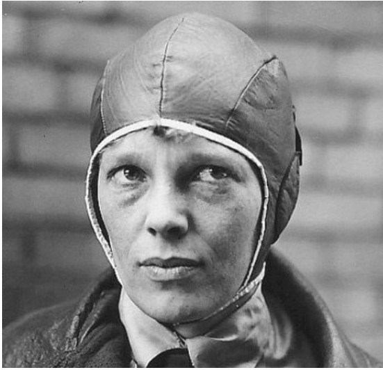
Amelia Earhart spoke in Yonkers in 1935