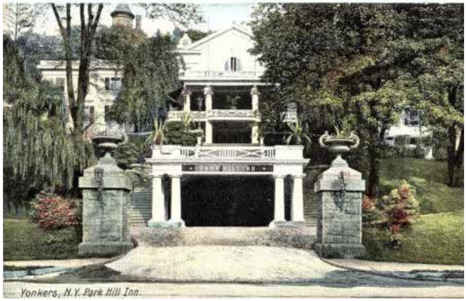
A postcard of the Park Hill Inn, a Yonkers hotel redesigned from the old Getty Homestead