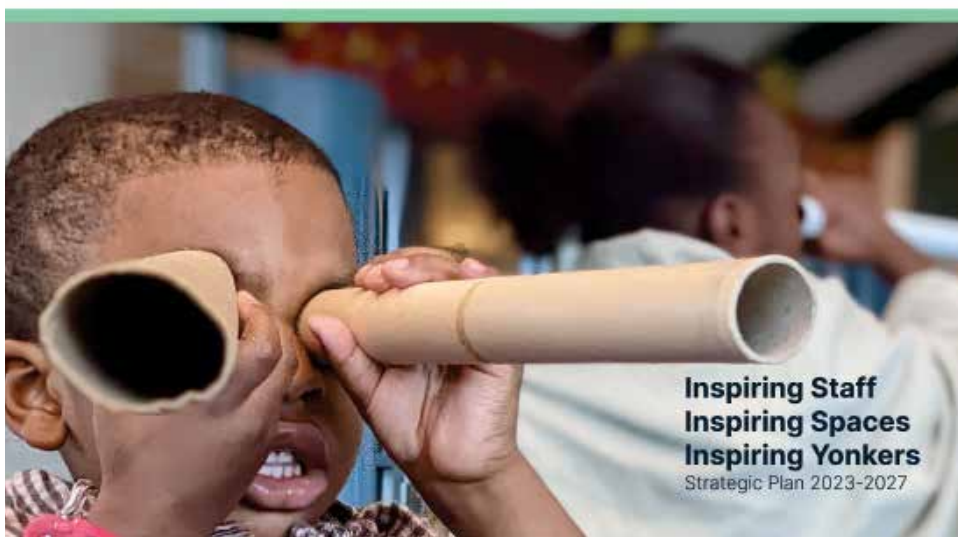
Inspiring Staff Inspiring Spaces Inspiring Yonkers Strategic Plan 2023-2027