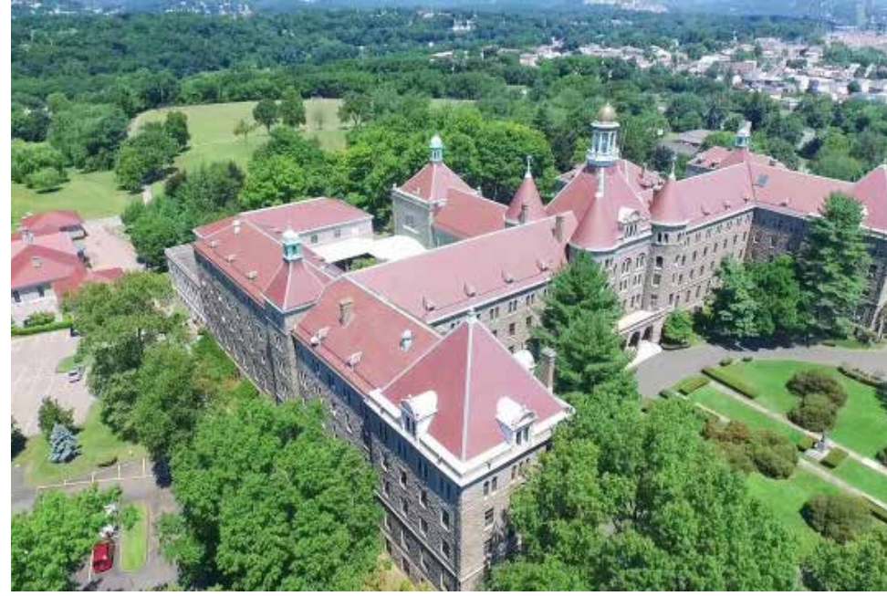
St. Joseph's Seminary, Yonkers