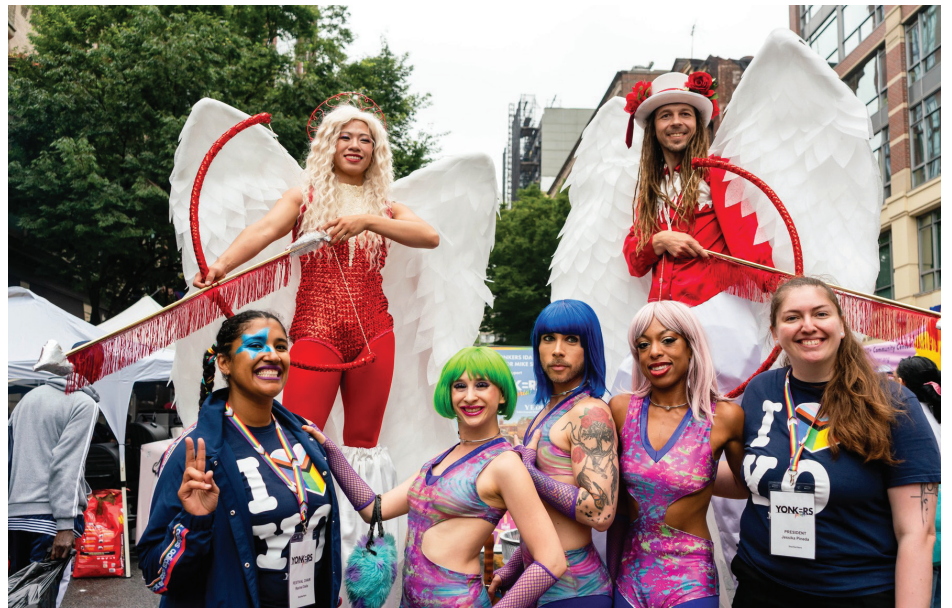
Kickoff Mixer Fundraiser on Thursday, May 21

Yonkers Pride, in partnership with the Yonkers Downtown/Waterfront BID, announces its 2026 Pride Month programming, anchored by the 9th Annual Yonkers Pride Festival on Saturday, June 13 from 1:00 PM to 7:00 PM along Main Street in Downtown Yonkers. This year's celebration also includes a Kick-Off Mixer on May 21, the annual Flag Raising on June 12, and the Yonkers LGBTQ+ Pride Scholarship, highlighting a continued commitment to visibility, opportunity, and community support.