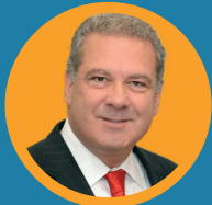
Mike Spano Yonkers Mayor