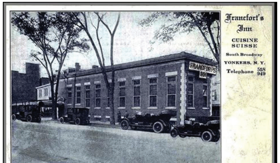
Francfort's Inn, one of Yonkers best Restaurants