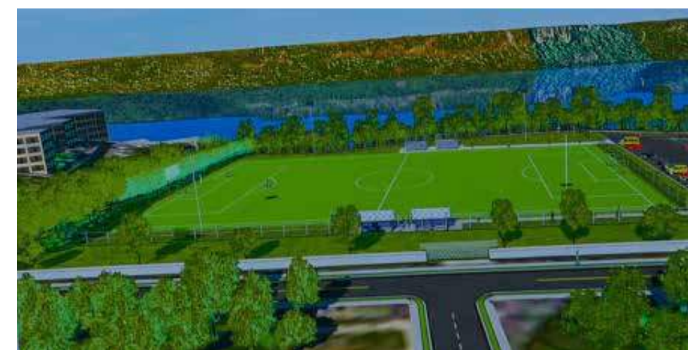
rendering of new soccer field above, and current parking lot off north Broadway below