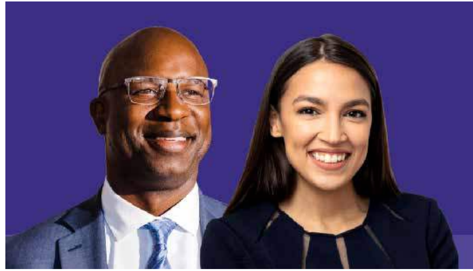
Westchester Congressman Jamaal Bowman, left, and Westchester native, Congresswoman Alexandria Ocasio-Cortez, both voted against a resolution in support of Israel