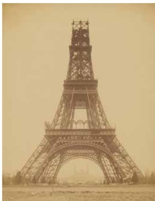
The Eiffel Tower under construction in 1888.

Otis Elevator Company, still operating in Yonkers, was the only company that could build the elevator for the World’s Fair in Paris.