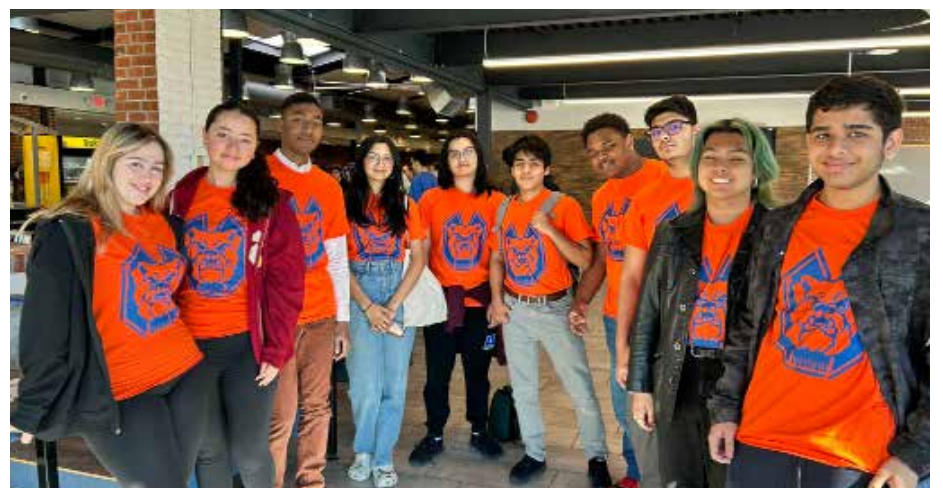
Below: The Yonkers Middle-High School History Bowl Team, competing at Horace Greeley, qualified for Nationals in Virginia this April. Go Bulldogs