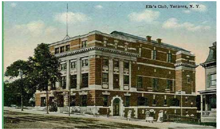
The Elks Club at the corner of Park Hill Avenue and South Broadway