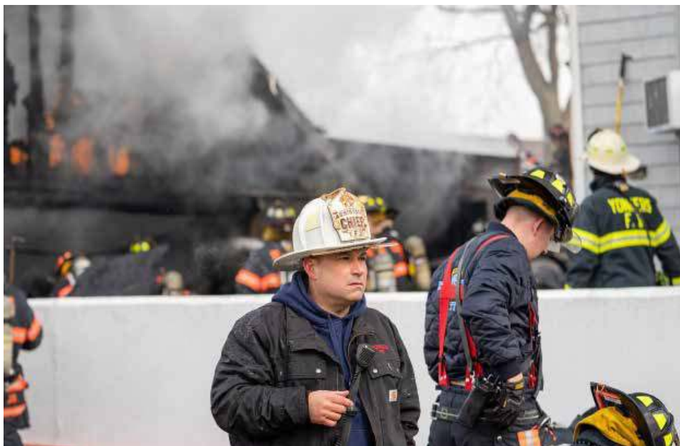
Thanks to the YFD for this photo which shows their excellence and dedication