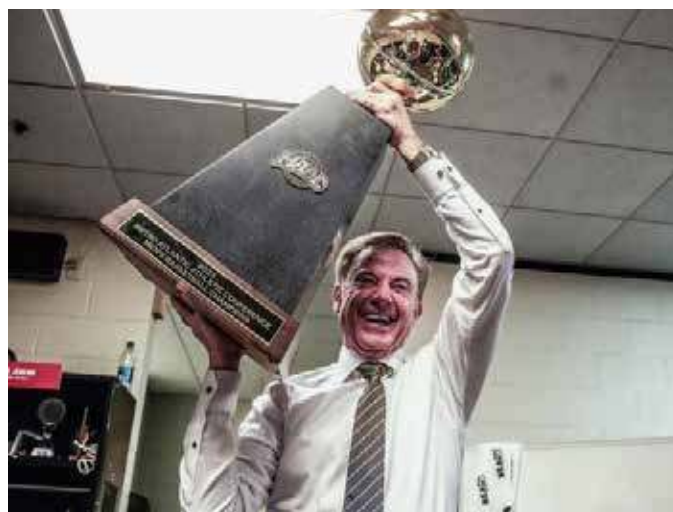
Iona Coach Rick Pitino holding the MAAC Championship trophy