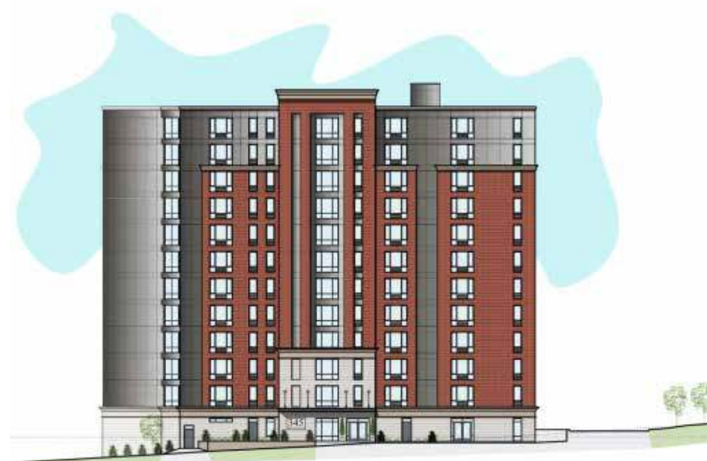
A rendering of affordable senior housing planned for 345 McLean Avenue

The Yonkers Industrial Development Agency (YIDA) voted at its March 6 monthly meeting preliminary approval of financial incentives for a $56.8 million affordable housing project for low-income seniors.