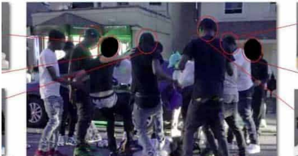
a photo of the video showing

The video, link, https://twitter.com/i/status/1424765076586778627 , posted by the Yonkers Police Department in 2021, has now been permanently removed by YouTube. The YPD appealed YouTube’s decision but just received word that their appeal was denied.