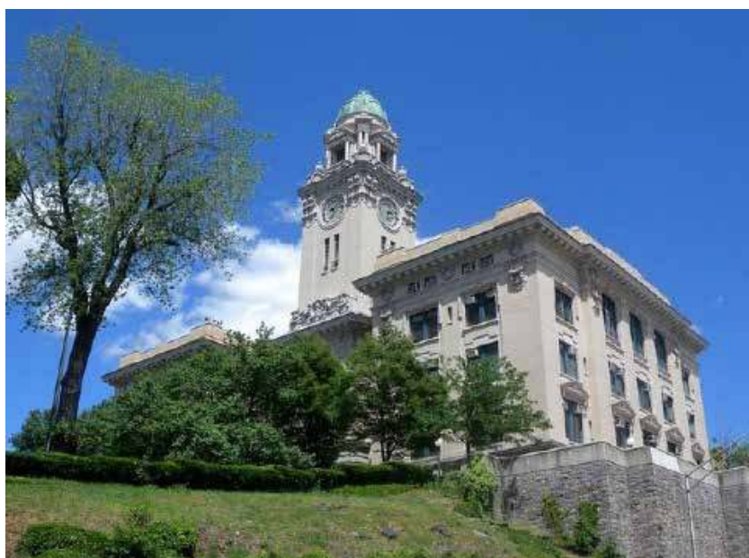
Yonkers City Hall