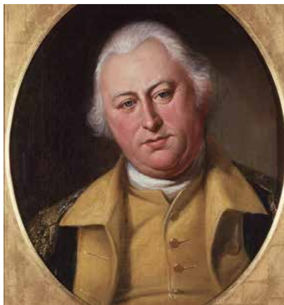
General Benjamin Lincoln left used the Thomas Valentine Homestead in Yonkers during the Revolutionary War