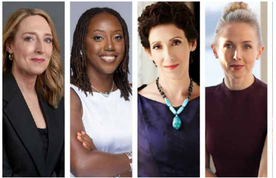
At the Hudson River Museum March 15