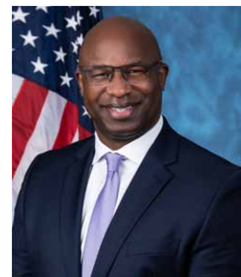
Congressman Jamaal Bowman

Congressman Jamaal Bowman, in a letter to President Joe Biden, proposed several actions the President could take to help ensure public safety and address the gun violence epidemic.