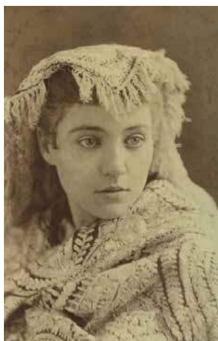
vintage actress Clara Morris