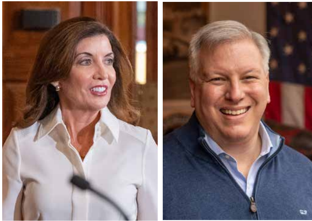
Governor Kathy Hochul, left, and Harry Wilson, right

Westchester democrats and republicans are heading to the polls, during early voting this week, and for the upcoming primary on June 28 for Governor and Assembly. Due to court cases and the redistricting of congressional lines in NY, another primary will be held in August for Congress and State Senate?