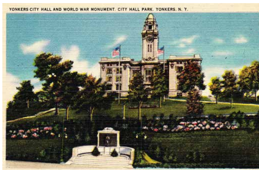
A Postcard of the Yonkers City World War Monument