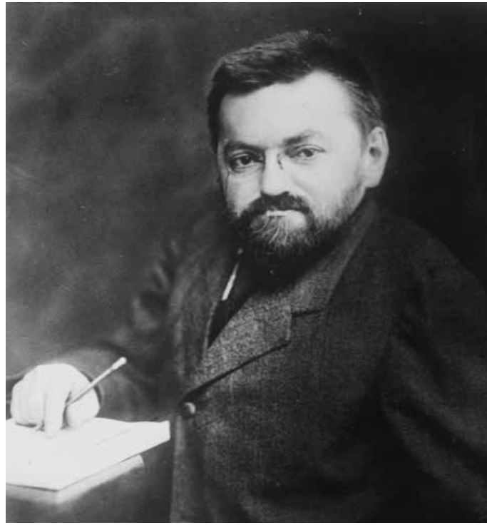
Electrical Engineering genius Charles Steinmetz about 1910