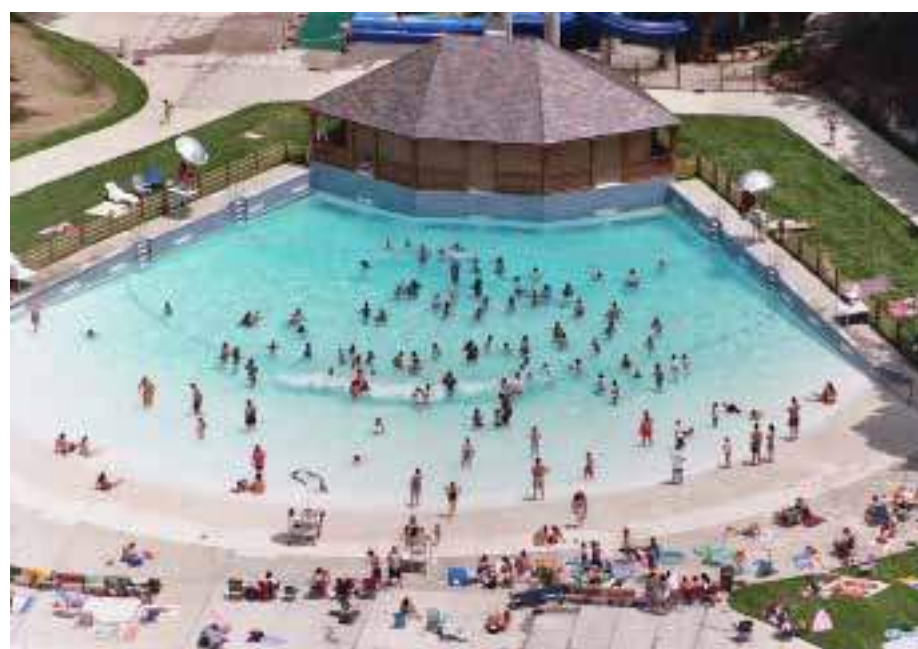
Willson's Wave Pool in Mount Vernon

Ride the waves into summer as Willson's Wave Pool in Mount Vernon opens Friday, June 23, along with the remainder of County-owned pools, Saxon Woods in White Plains, and Sprain Ridge and The Brook at Tibbetts, both in Yonkers!