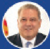
Mayor MIKE SPANO