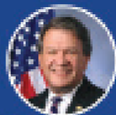
Congressman GEORGE LATIMER