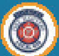
Yonkers Firefighters Local 628