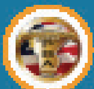
Westchester County PBA