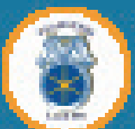
Teachers Local 456