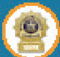
Westchester County Correctional Center