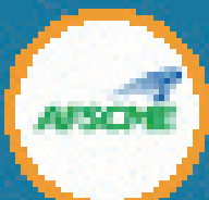
AFSCME Local 1897