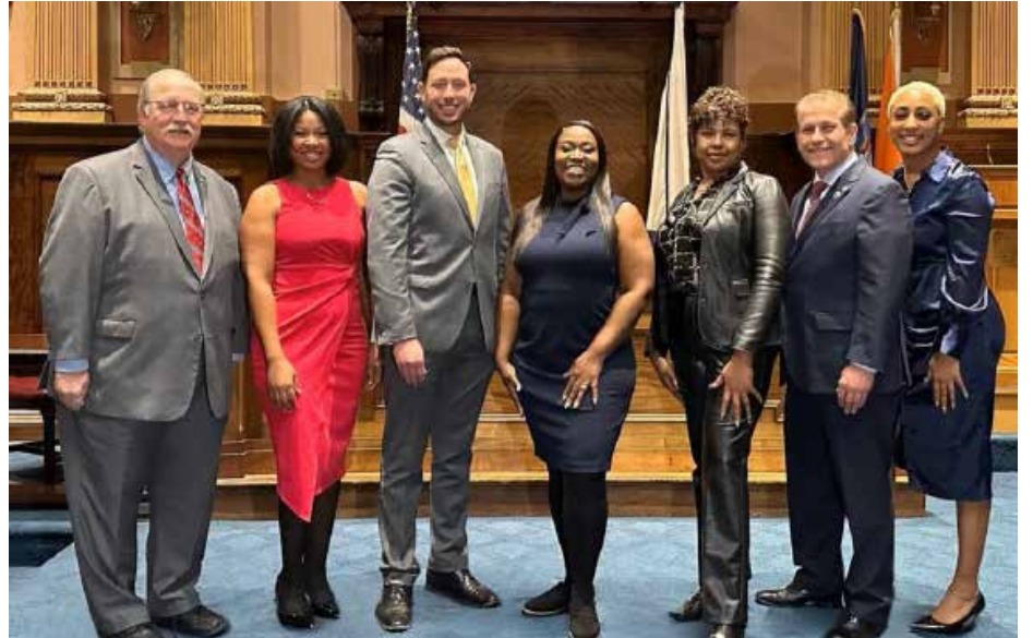
Yonkers City Council members had to make tough budget decisions