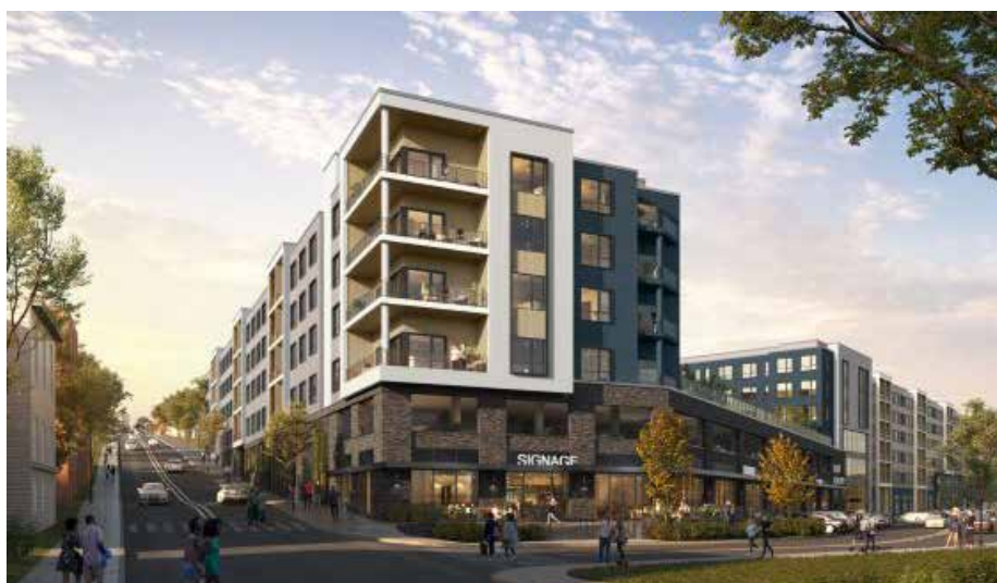
Rendering of Park Square, Yonkers

The Yonkers Industrial Development Agency (YIDA) has voted preliminary approval of financial incentives for three new mixed-use developments representing a total private investment of approximately $463.5 million. The three developments are projected to create a total of 1,100 construction jobs and 1,083 residential units including affordable senior housing.