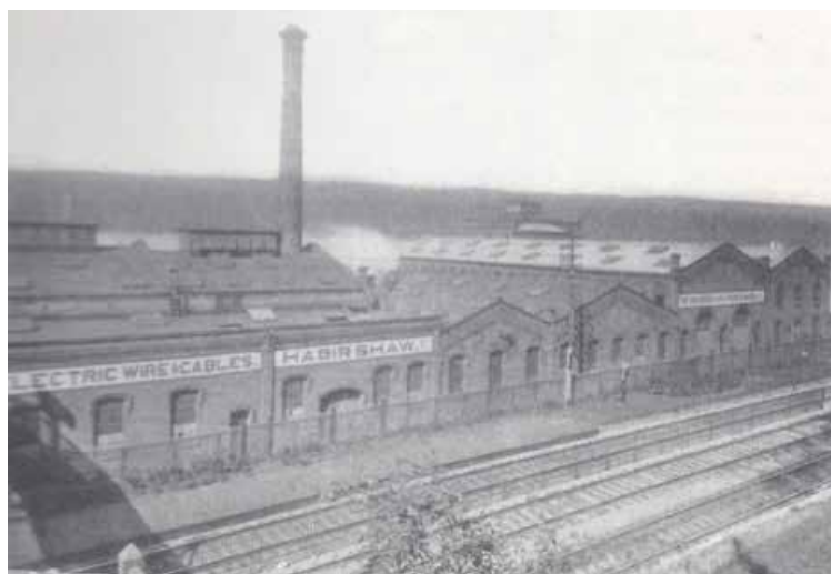
The Habirshaw Cable and Wire Company