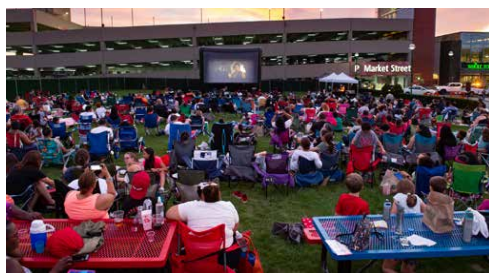
Starting July 5-The Lion King and a Move Every Monday Evening This

Ridge Hill is once again bringing the big screen to the South Lawn with the announcement of "Movies on the Lawn," a weekly evening under the stars experience featuring blockbuster movies from a variety of genres. The movies will be screened on Monday nights for a total of ten weeks beginning on July 5 and running through September 6, 2021. Ridge Hill is offering an extensive list of films including comedy, action, animation and more, making it fun and appealing for all members of the family.