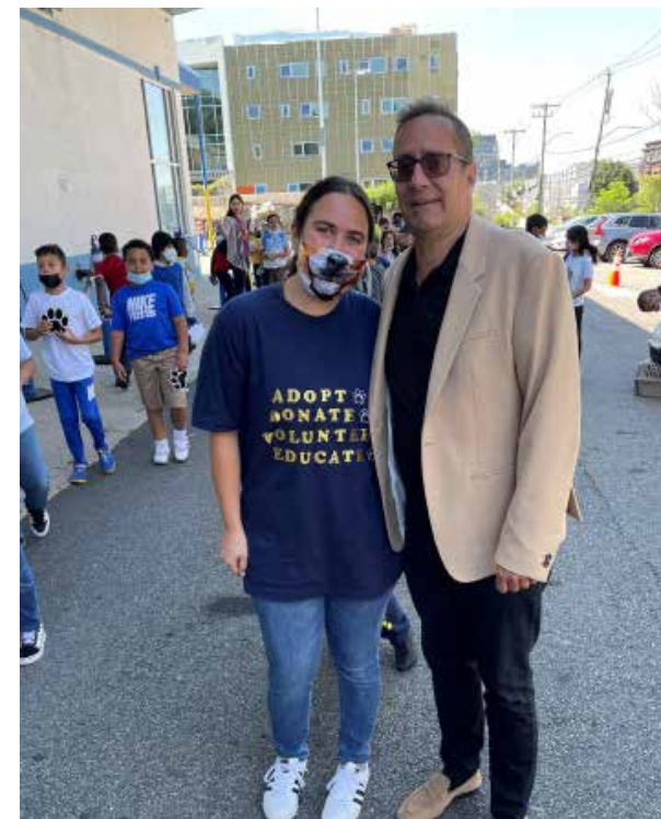
Above: CSEE Second Graders with the supplies they collected for the Yonkers Animal Shelter