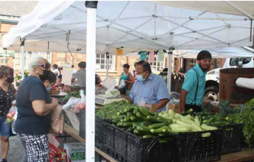
Yonkers Seniors can get coupons to buy healthy foods at the St. John's Church Farmer's Market, pictured above