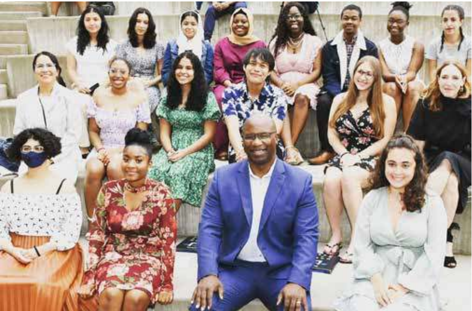
Congressman Jamaal Bowman, center, with HRM Junior Docent Class of 2021