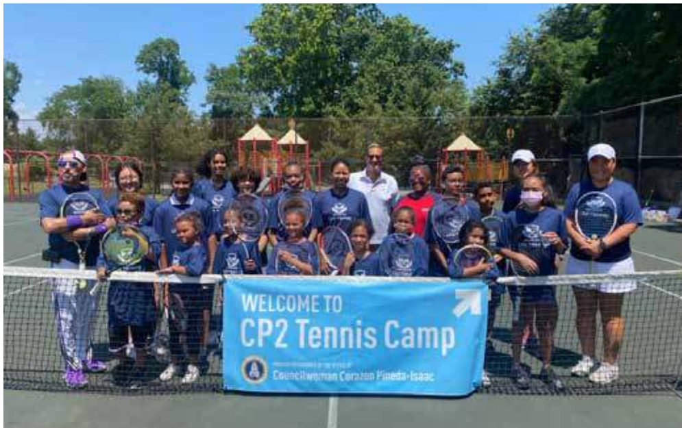
participants in the 2021 CP2 Tennis Camp