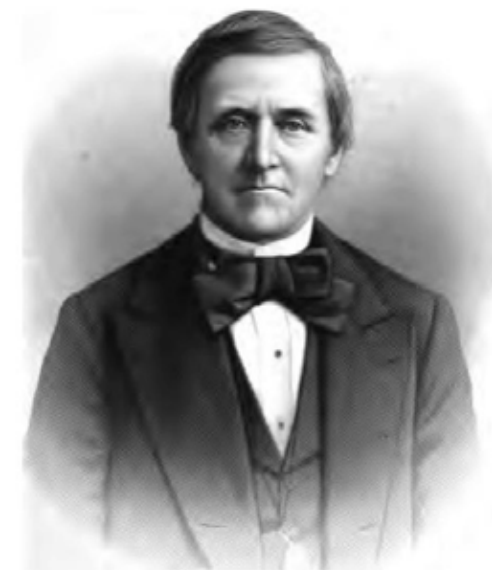
NY Governor and Presidential candidate Sam Tilden called Yonkers and the Greystone mansion his summer home