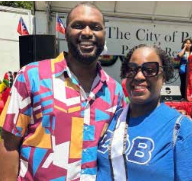
former Congressman Mondaire Jones, with a supporter in Peekskill