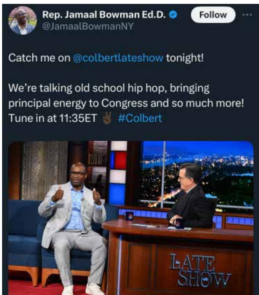
By Dan Murphy

Ice Bucket Challenge, continued from pg 1-