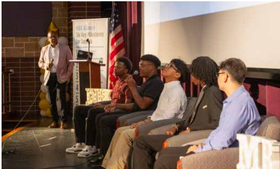
panel discussion with MBK alum and current students