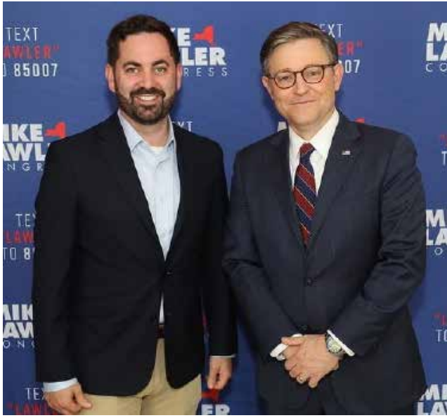
House Speaker Mike Johnson, right made his second trip to the 17-congressional district of NY to support Rep. Mike Lawler