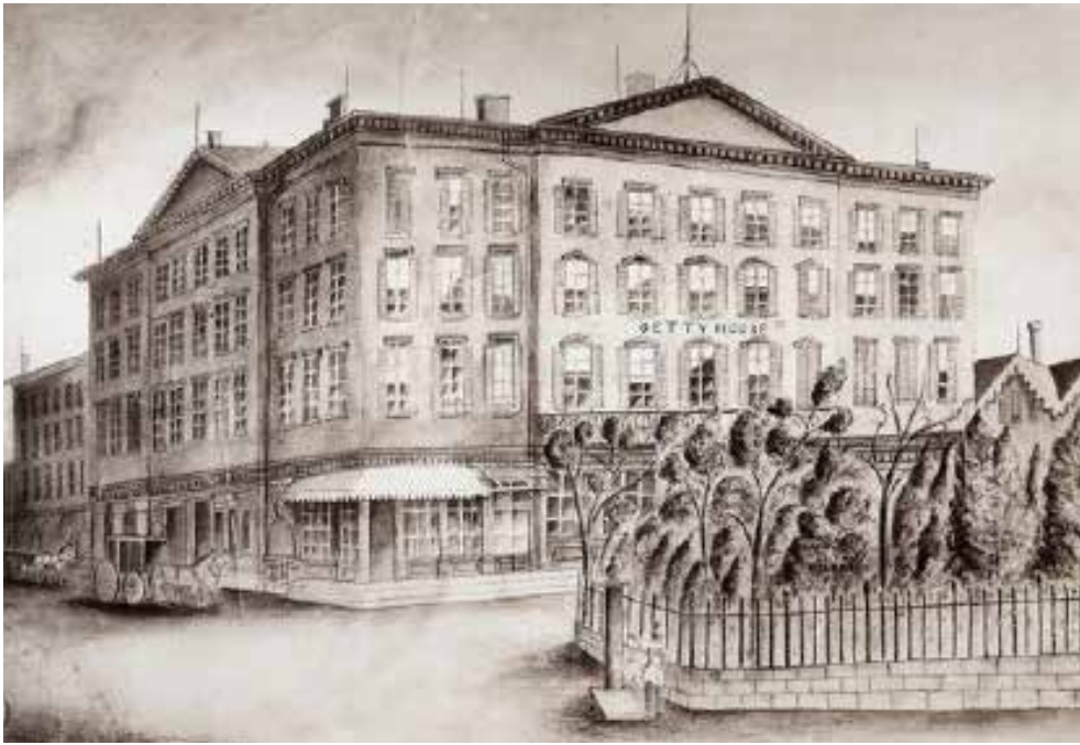
A sketch of the Getty House shortly after it opened on South Broadway