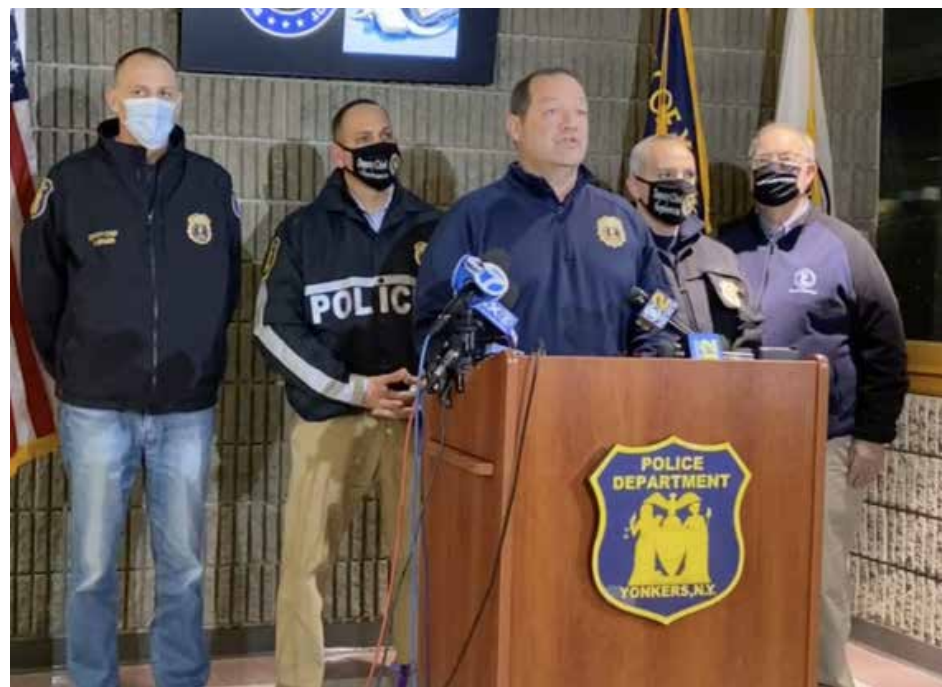
YPD Commissioner Mueller at Press Conference

On Monday, January 17th, 2022, at approximately 12:29 PM, members of the Yonkers Police Department responded to 52 Main Street, third floor, on a 911 call of a man waving a gun threatening people. Upon arrival officers made contact with a male subject on the third floor resulting in a police-involved shooting. The area was cordoned-off and both criminal and internal investigations were initiated. Investigation thus far has yielded that when officers made initial contact with the male subject, he shouted that he had a gun.