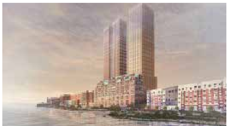
A rendering of Teutonia Hall

The Yonkers Industrial Development Agency (IDA) continued its key role as a driving force in Yonkers economic renaissance with another record year of voting approvals of financial incentives for residential and commercial projects representing a total private investment of $802 million. The developments are projected to create approximately 1,700 new residential units and approximately 1,800 construction jobs.