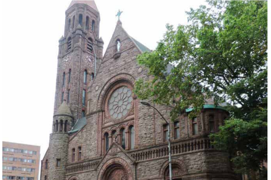
St. Mary's Church