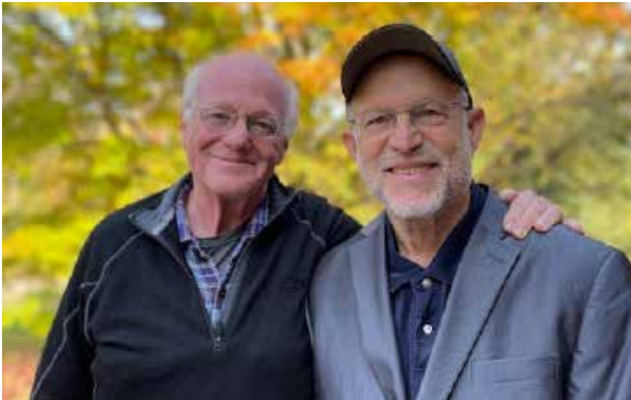
Reception and panel discussion featuring filmmaker and Ben & Jerry, pictured above, will follow

Zen Brownie, an award-winning documentary on the story behind Greyston Bakery, will be shown January 25 at The Picture House in Bronxville followed by a panel discussion and special reception featuring famous ice cream makers Ben & Jerry.