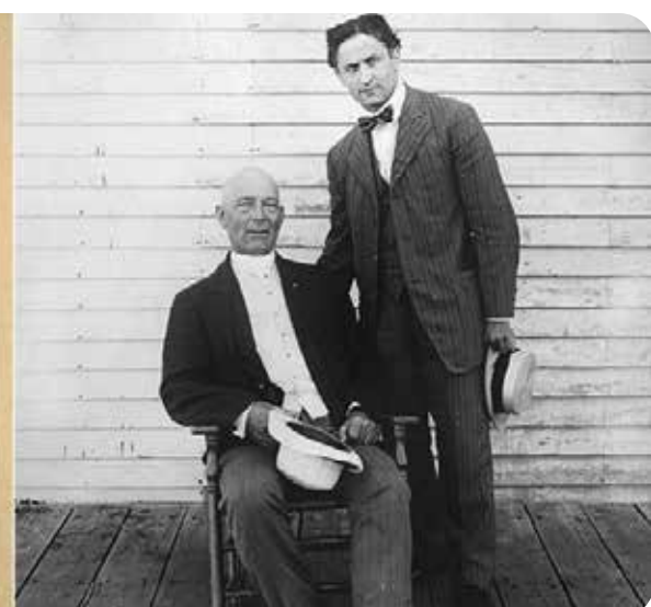
America's Two Greatest Magicians: Harry Houdini, standing, and Harry Kellar, from Yonkers, seated