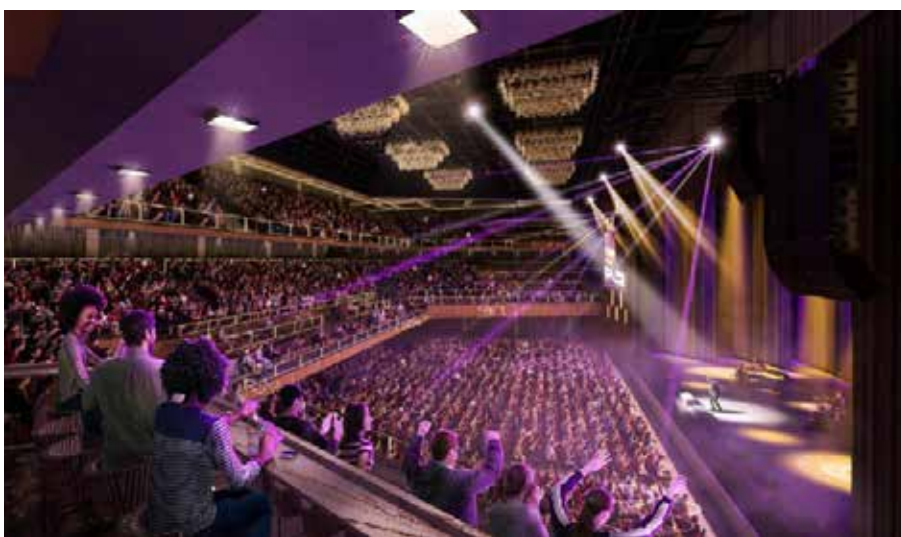
A 5,000 seat entertainment venue are part of MGM plans for a new Casino in Yonkers

MGM Resorts International recently unveiled its vision to transition Empire City Casino by MGM Resorts into a world-class entertainment destination, MGM Empire City, if awarded a commercial casino license for its historic Yonkers, New York site. Key elements of the phase one design include a comprehensive casino floor redevelopment and expansion, 5,000-capacity entertainment venue, state-of-the-art BetMGM sportsbook, food and beverage outlets by celebrated chefs, cocktail bars and lounges, technologically advanced meeting spaces and more.