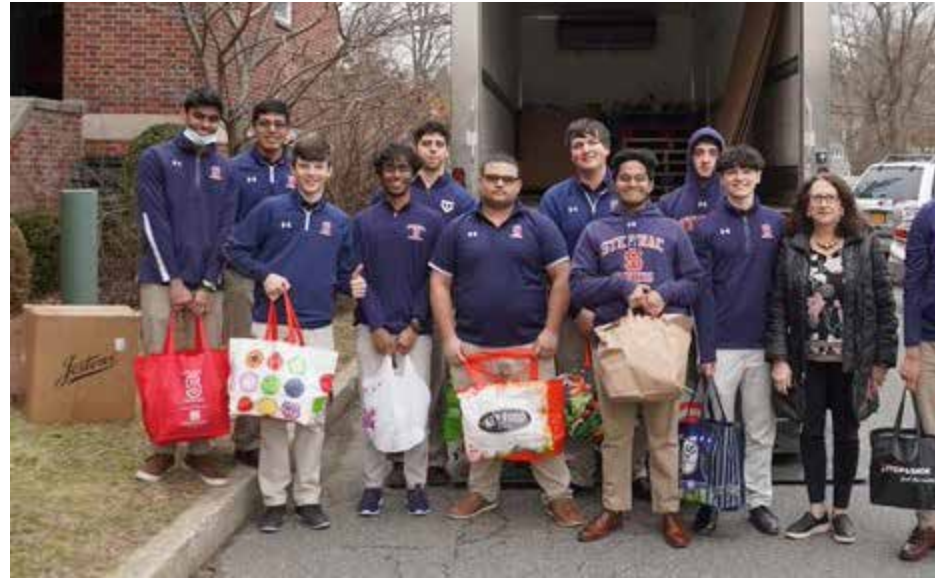
Stepinac's students who participated in last year's SOUPER Bowl Food Drive.

Continuing a 12-year tradition, Stepinac High School students are mobilizing their efforts in the school's single largest annual food drive, known as the SOUPER Bowl, to help Feeding Westchester meet its critically important mission.