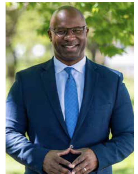
Congressman Jamaal Bowman