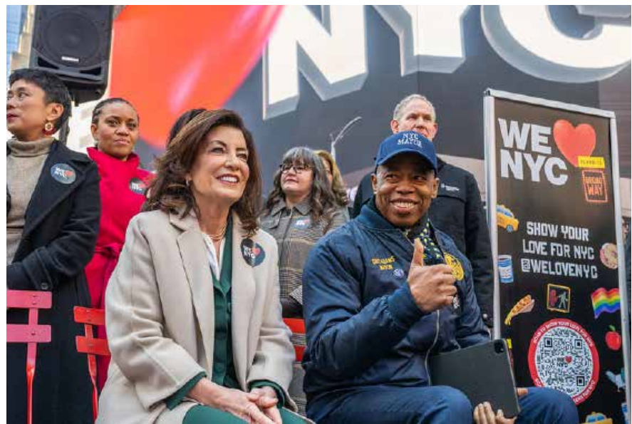
Governor Hochul, left is considering weather to remove NYC Mayor Adams from office

One of the three most powerful Democrats in New York State has now said that New York City Mayor Eric Adams should resign his post.