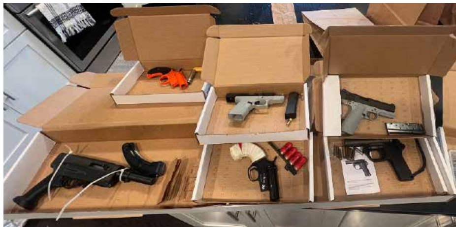
Some of the Ghost Guns found by Westchester County & Lewisboro Police