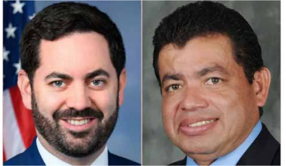
Congressman Mike Lawler