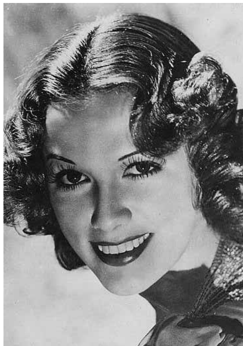
left: Dancer Eleanor Powell, from Yonkers