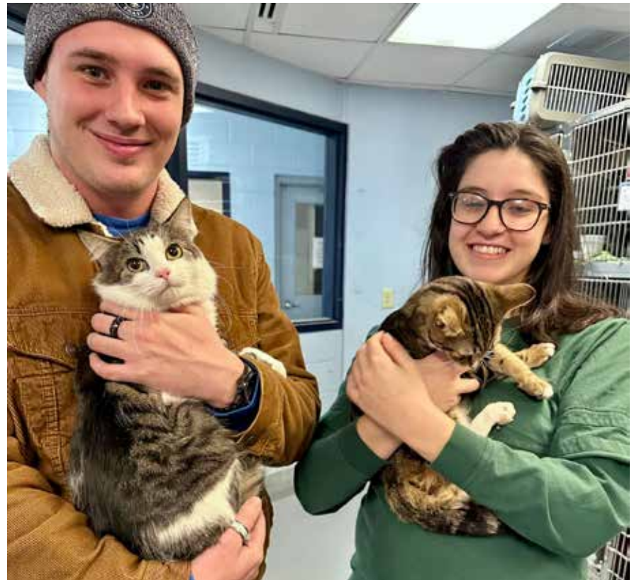
Above-two of the first cats adopted from the house by a Brooklyn couple; below 200 cats were found and are being rescued by volunteers and the Yonkers Animal Shelter