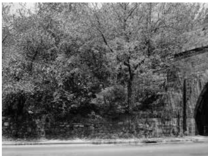
The Nepperhan or Saw Mill River culvert by Nepperhan Avenue in Yonkers.