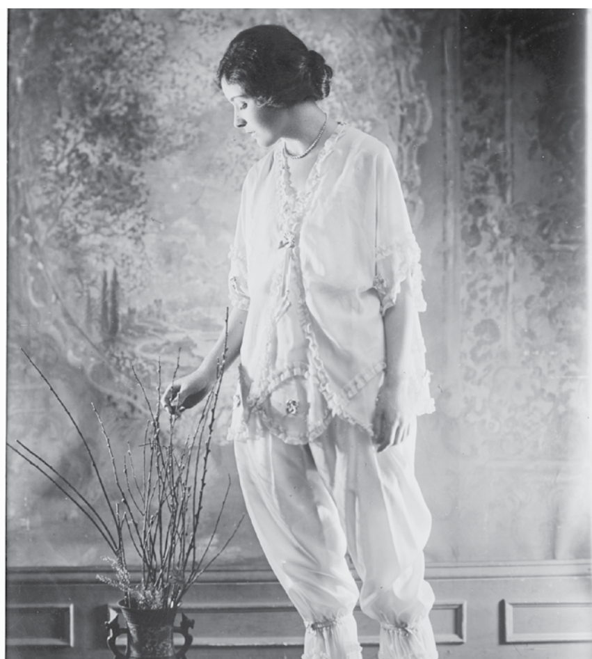
movie star Virginia Valli was married in Yonkers in 1931