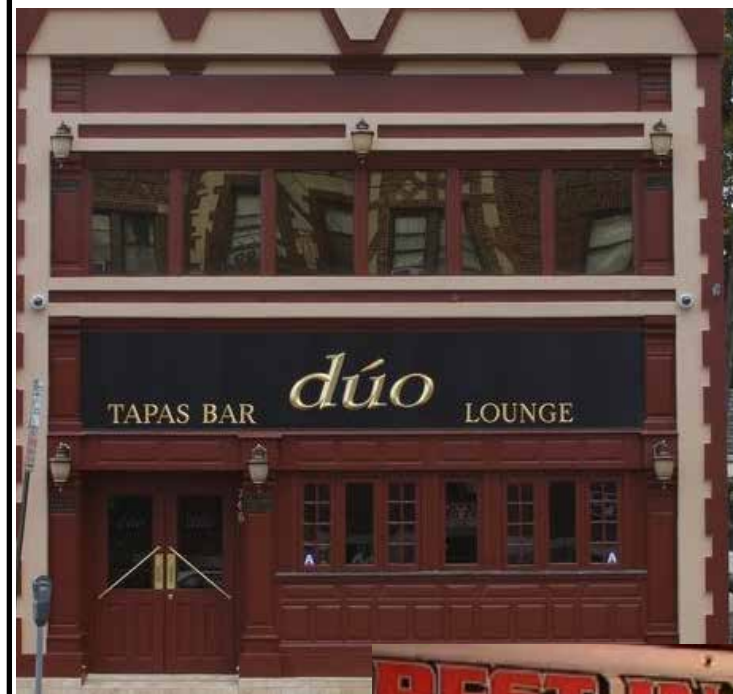
The Duo Tapas Lounge 743 Yonkers Ave.