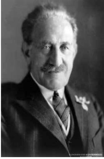
Samuel Untermyer, one of Yonkers most famous residents