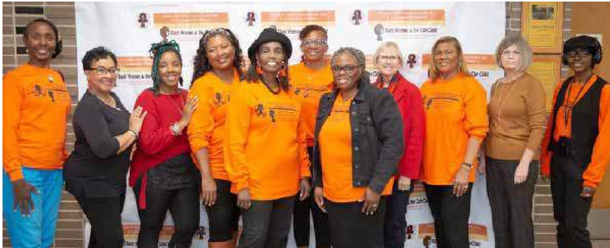
Participants in STSI movie screening and ribbon cutting

Sister to Sister International has been at the forefront of promoting awareness and systemic change around the Black maternal health crisis in the United States and its impact on Westchester County and the region.