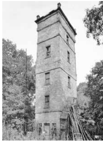
An early 20th century photo of the Nodine Hill Water Tower