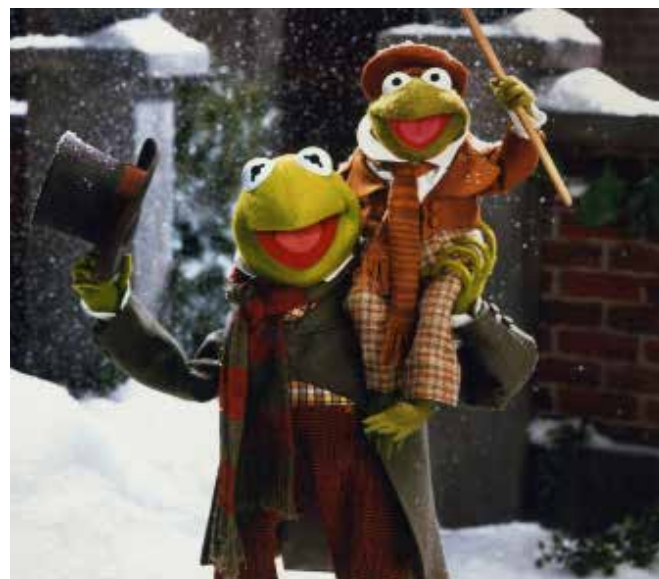
left: The Muppet Christmas Carol

PCNY works with The Hometown Foundation in this effort. Thanks for all that you do for Yonkers!