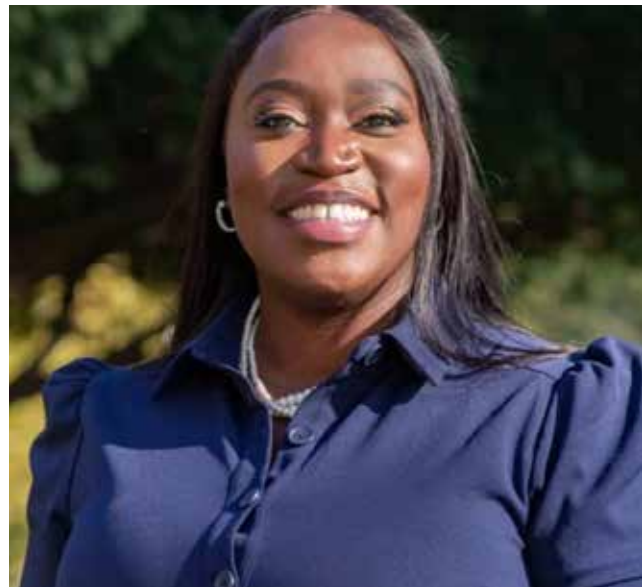
Yonkers City Council President Lakisha Collins-Bellamy