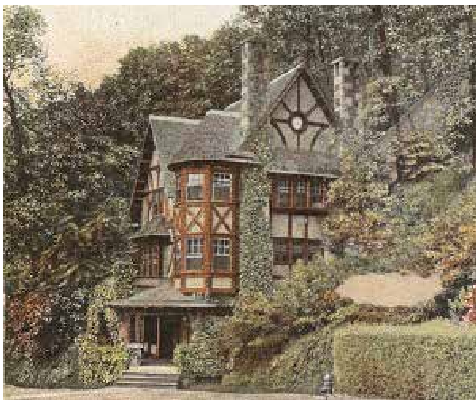
Lower elevator house for the Park Hill elevator