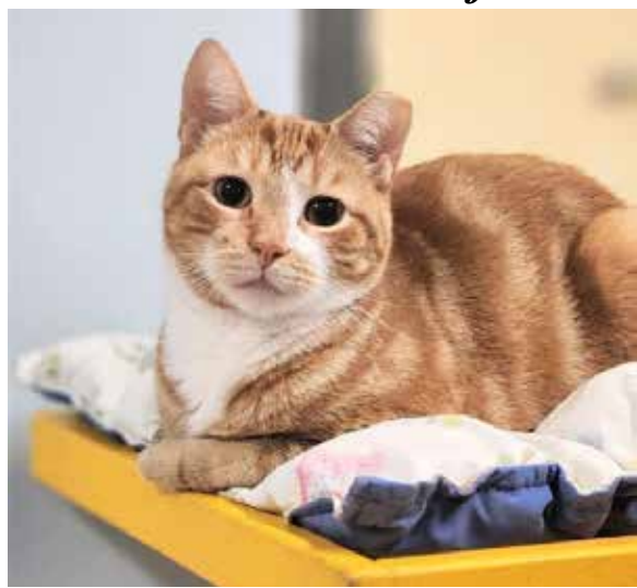
adopt Bolton today