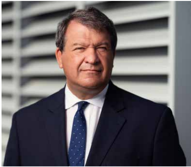
Westchester County Executive and Congressional candidate George Latimer