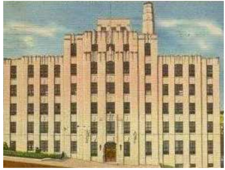
The Yonkers Health Center, one of the first comprehensive full service municipal clinic and research facilities in the country. Now it is used for City of Yonkes offices