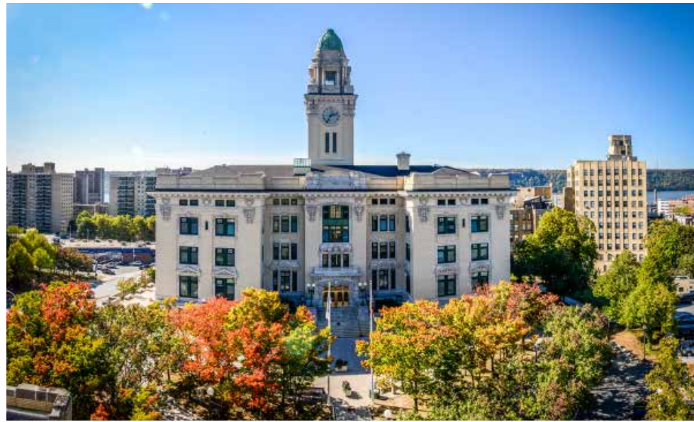
Yonkers City Hall